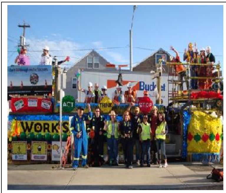
Volunteers from the ACSA, Work Safe and EPCOR gathered around the Work Safe for Life float on July 22 nd for the Capital Ex parade.

Edmonton: #101 13025 St. Albert Trail NW Edmonton, AB, T5L 4H5